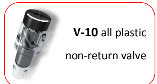
V-10 all plastic non-return valve